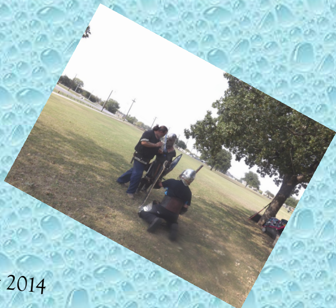
Gathering in the Park Oct 2014