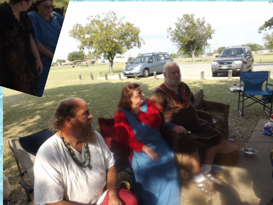
Gathering in the Park Oct 2014