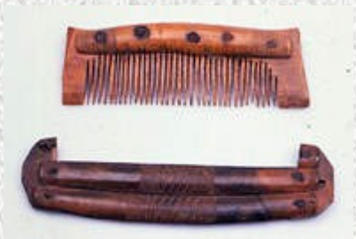
Man's comb and case

They used combs, ear spoons, tweezers, razors, nail cleaners, and picks among other things. Combs were functional as well as decorative. They were made from elephant and, walrus ivory, and whalebone, the fine teeth were very close in many cases, and this side was likely used for control of pests in one's hair. The coarser side would have been used to comb out tangles and style the hair. Men's combs were usually kept in a case the shape of the comb to protect the teeth. Women's combs were kept in a purse or pouch.