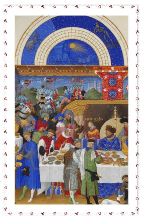
Très Riches Heures— January