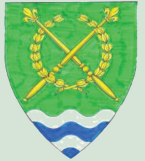
PHOTO AND ARTICLE CREDITS