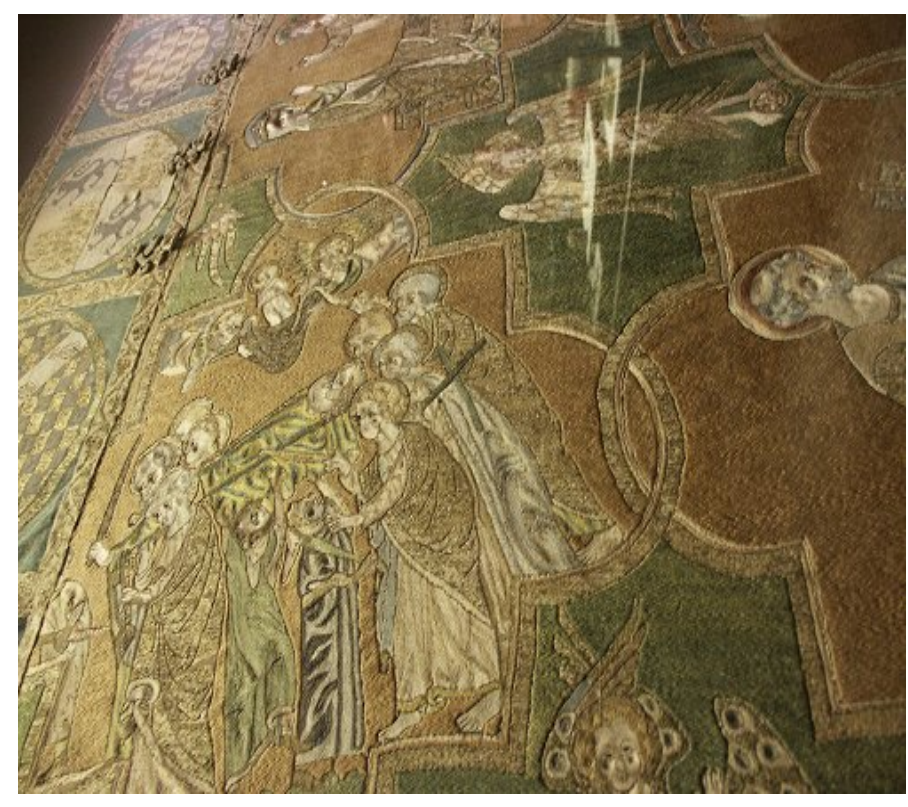
The Syon Cope from the Victoria and Albert Museum

The skeins of silk were separated into single strands complete the work. Using a single strand of thread made technique more timeconsuming, but also allowed for finer details in these smaller pieces.