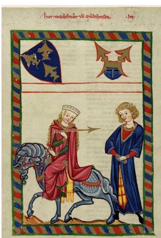
Illumination of Herr Wachsmut von Mühlhausen, from the Manesse Codex

The panels were designed to be appliqued to a velvet background and used as a vigil book cover for a friend's peerage ceremony. The commercially purchased journal is approximately 8"by 6", and this dictated the design size.