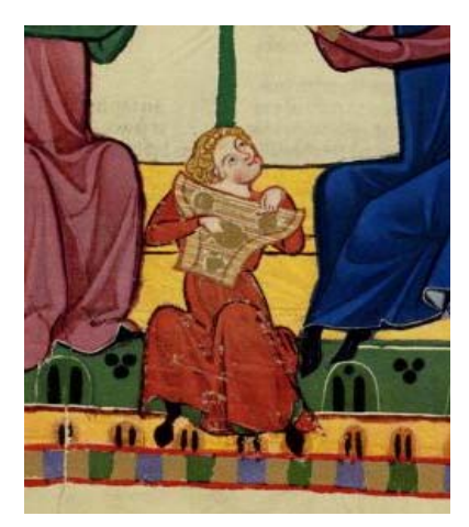
Musician, detail from the Manesse Codex

As I wanted the finished piece to have the look of the illuminations upon which the design was based, I commissioned