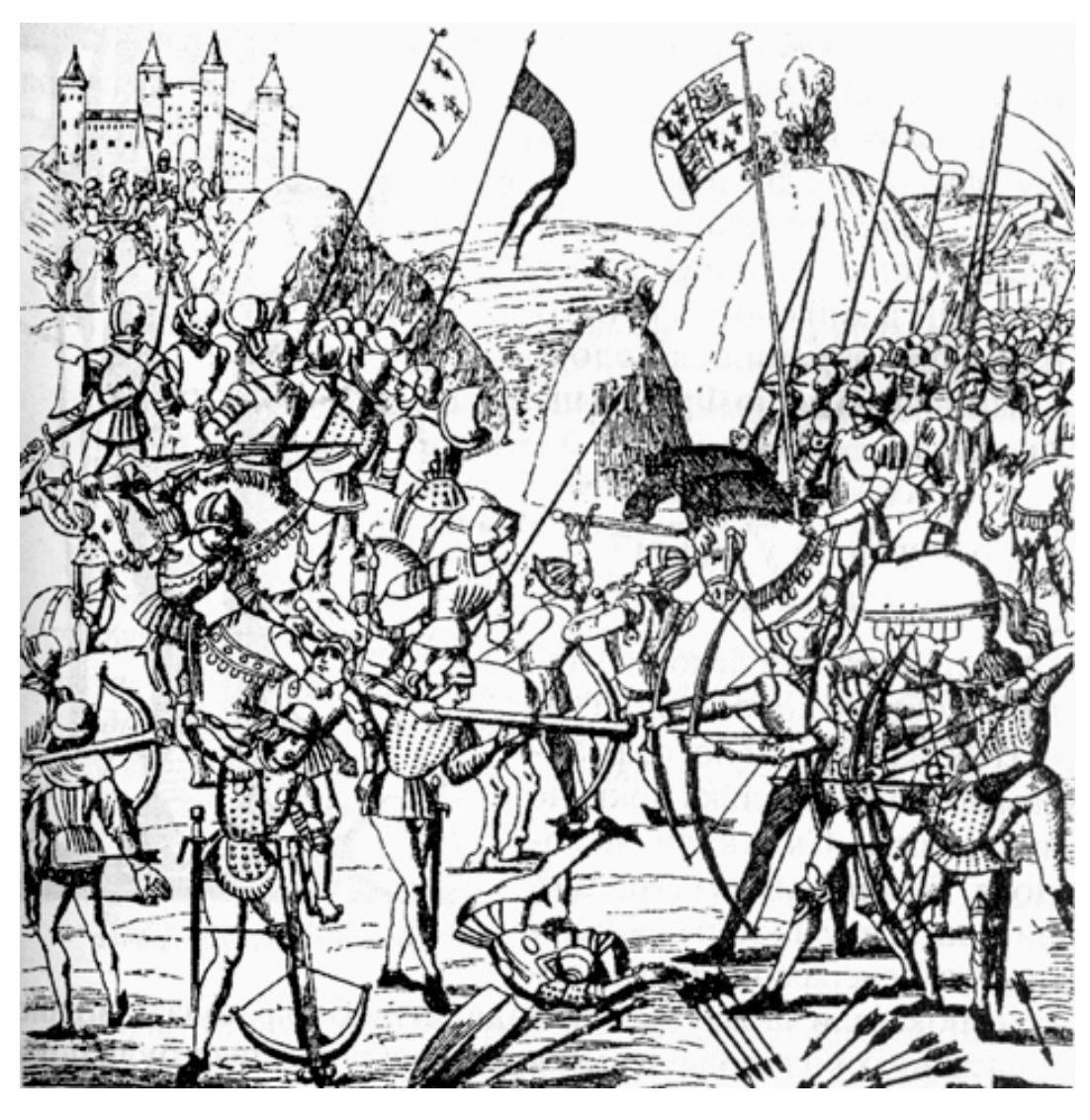
March Anno Societatis LIII