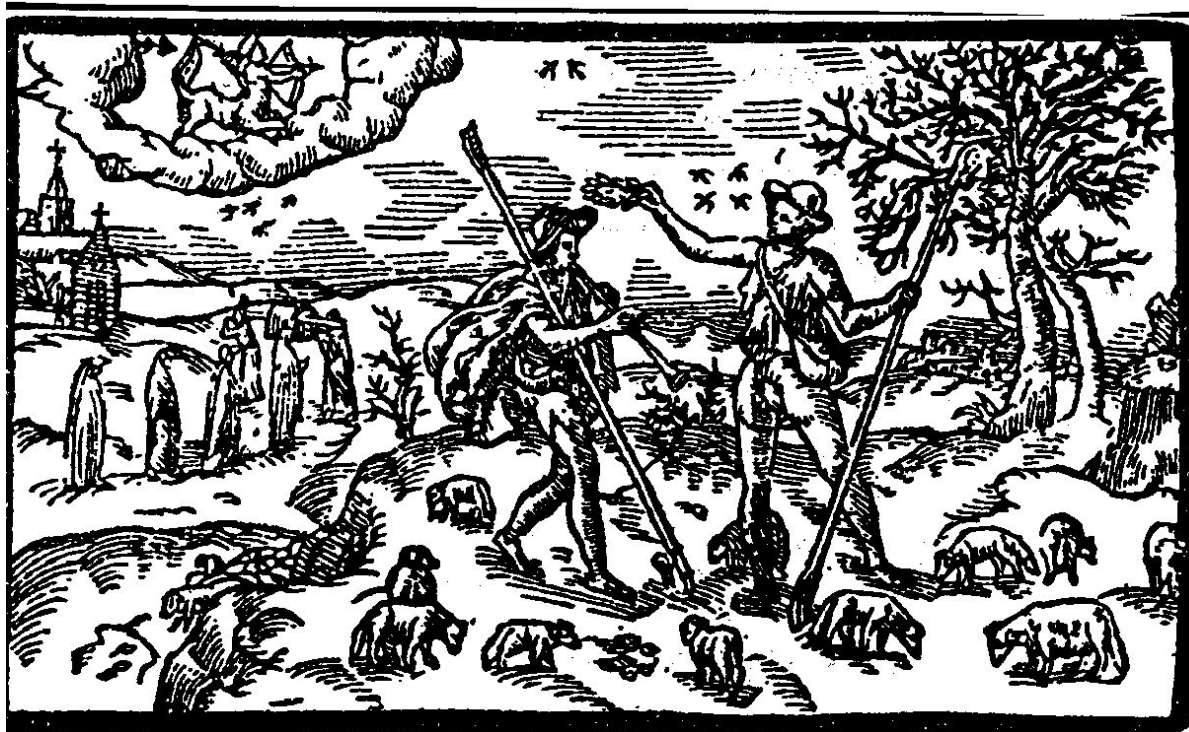
The month of November; detail of a page from The Shepheardes Calendar , 1579.