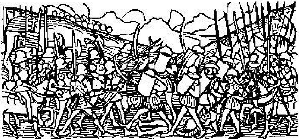
Battle scene; from Johannes de Thwroc, Chronica Hungarorum , Augsburg (Ratdolt) 1488.