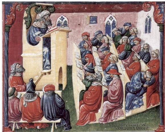
A lecture at the University of Bologna in Italy in the mid-fourteenth century. The lecturer reads from a text on the lectern while students in the back sleep.

https://www.facebook.com/events/461430544442180/