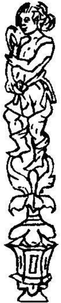
Borderpiece of a page from Officium B. V. Mariae, Venice, 1493