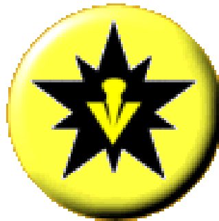
Thrown Weapons Marshal OPEN FOR APPLICATION thrown-weapons@namron.ansteorra.org