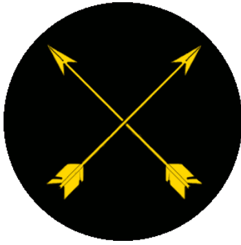
Archery Marshal Office open for application missile@namron.ansteorra.org