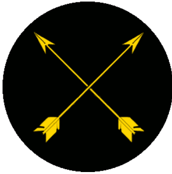
Archery Marshal Office open for application missile@namron.ansteorra.org