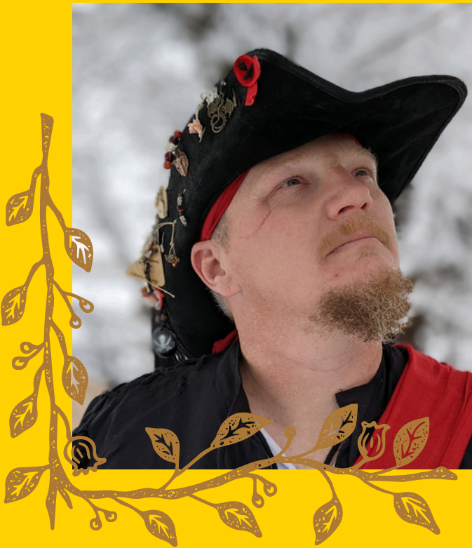
Baron of Namron