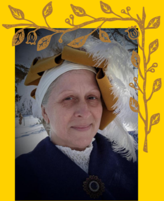
Hersirkona of Namron