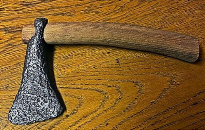
Francisca with shaft