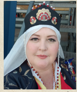
Minister of Arts and Sciences