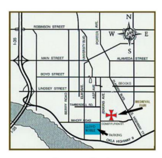
Reaves Park 2501 Jenkins Ave. Norman, OK 73072

Minors must be accompanied by a parent or legal guardian. They may also attend with a 21year-old or older adult with a signed and notarized Minor Event Waiver from the parents.