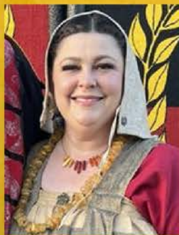
Chronicler - Editor