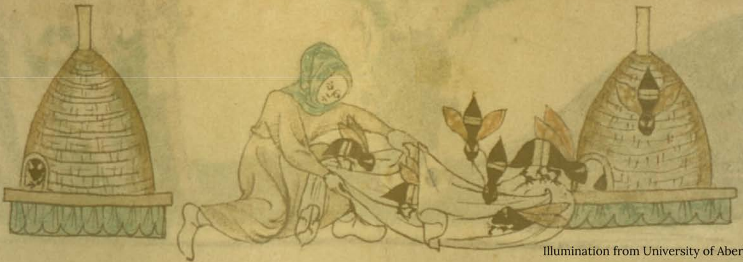
Illumination from University of Aberdeen

If you would like to see your work featured in the next issue of Whispers on the Wind , please submit your articles or other items to the Chronicler by June 26th!