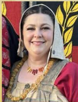
Chronicler - Editor