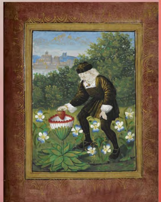
Illumination from the the British Libraryr