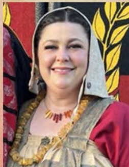
Chronicler - Editor