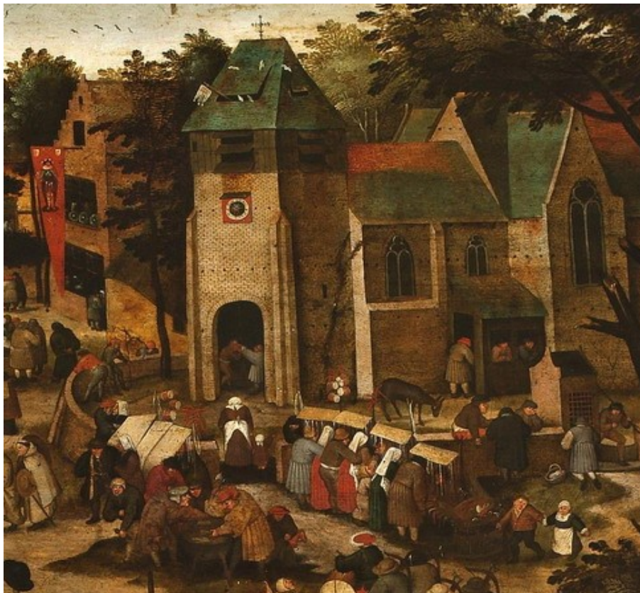
Performance at the fair by Pieter Brueghel, the younger, late 16th century