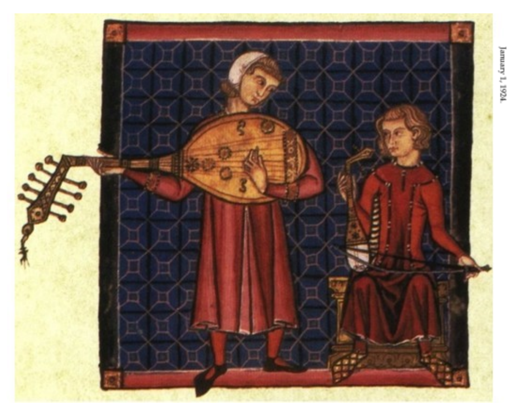
This work is in the public domain in its country of origin and other countries and areas where the copyright term is the author's life plus 100 years or less. This work is in the public domain is the United States because it was published (or registered with the U.S. Copyright Office) before