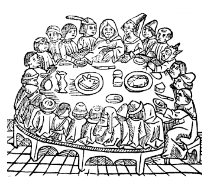
A woodcut from William Caxton's second edition of The Canterbury Tales printed in 1483

But natheles, whyl I have tyme and space, Er that I ferther in this tale pace, Me thinketh it acordaunt to resoun, To telle yow al the condicioun Of ech of hem, so as it semed me, And whiche they weren, and of what degree; And eek in what array that they were inne: And at a knight than wol I first biginne.