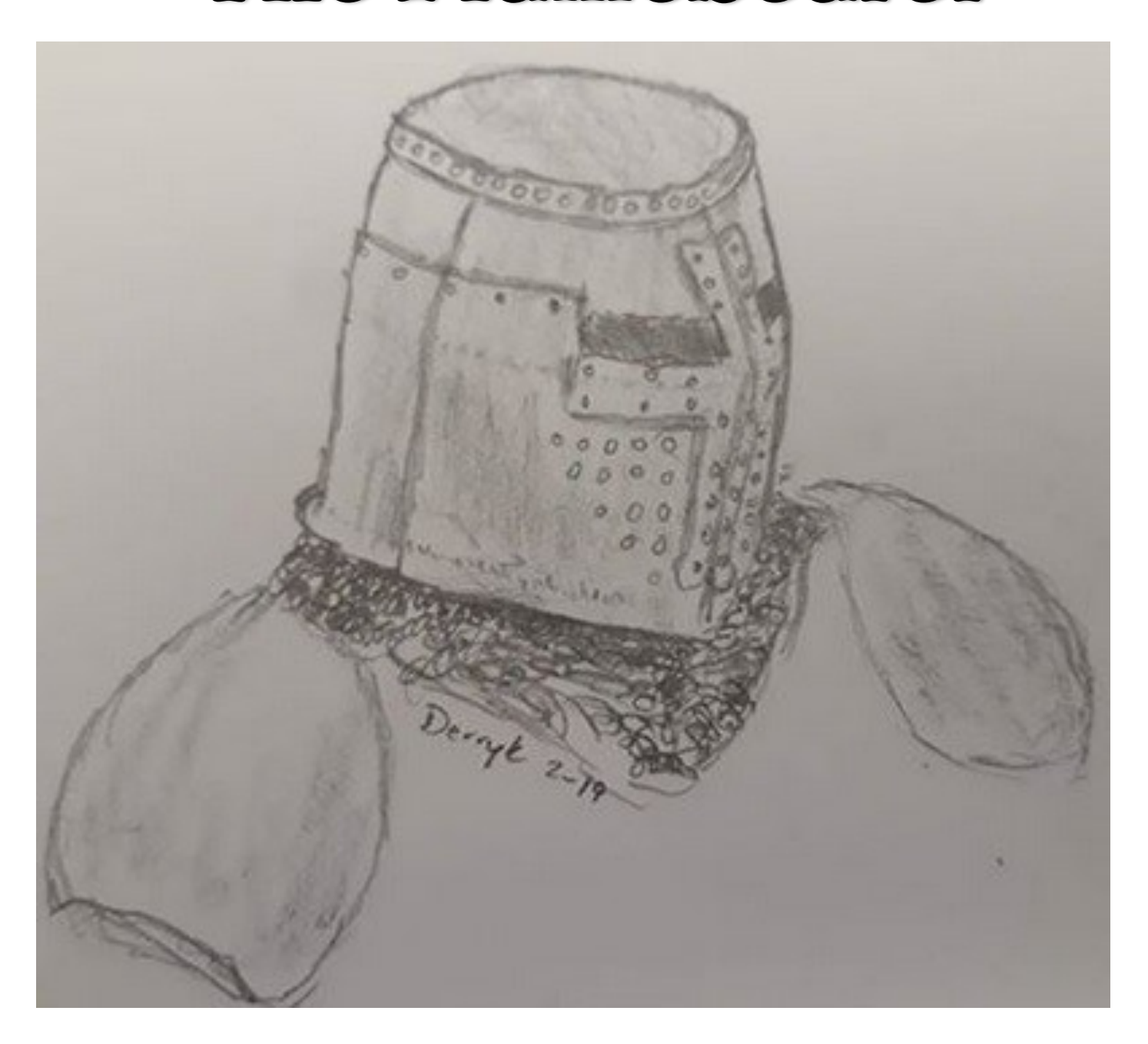
The Barony of Wiesenfeuer Anno Societatis Llll Being March 2019 CE