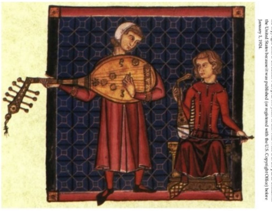
This work is in the public domain in its country of origin and other countries and areas where the copyright term is the author's life-plus 100 years or less. This work is in the public domain in the United States because it was published (or negistered with the U.S. Copyright Office) before