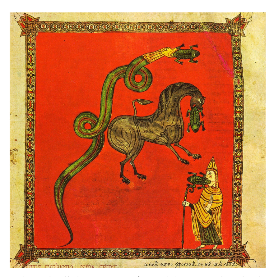
These works are in the public domain in its country of origin and other countries and area where the copyright term is the author's life plus 100 years or less and in the United states because if was published (or registered with the US Copyright Office) before January 1,1924.

In the same season Fayoles, the fourth King of Numidia, sent out of the country of Africa to Grangousier the most hideously great mare that ever was seen, and of the strangest form, for you know well enough how it is said that Africa always is productive of some new thing. She was as big as six elephants, and had her feet cloven into fingers, like Julius Caesar's horse, with slouch-hanging ears, like the goats in Languedoc, and a little horn on her buttock. She was of a burnt sorrel hue, with a little mixture of dapple-grey spots, but above all she had horrible tail; for it was little more or less than every whit as great as the steeple-pillar of St. Mark beside Langes: and squared as that is, with tuffs and ennicroches or hair-plaits wrought within one another, no otherwise than as the beards are upon the ears of corn.