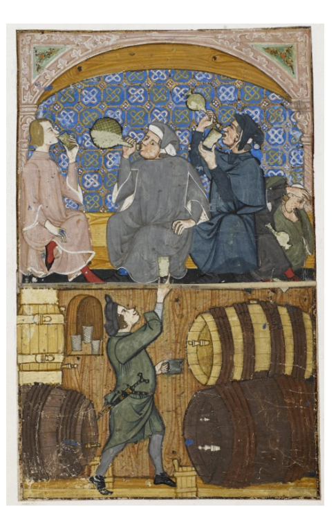
This work is in the public domain in its country of origin and other countries and area where the copyright term is the author's life plus 100 years or less and in the United states because if was published (or registered with the US Copyright

high way, always making good cheer, and were very pleasant till they came a little above Orleans, in which place there was a forest of five-and-thirty leagues long, and seventeen in breadth, or thereabouts. This forest was most horribly fertile and copious in dorflies, hornets, and wasps, so that it was a very purgatory for the poor mares, asses, and horses. But Gargantua's mare did avenge herself handsomely of all the outrages therein committed upon beasts of her kind, and that by a trick whereof they had no suspicion. For as soon as ever they were entered into the said forest, and that the wasps had given the assault, she drew out and unsheathed her tail, and therewith skirmishing, did so sweep them that she overthrew all the wood alongst and athwart, here and there, this way and that way, longwise and sidewise, over and under, and felled everywhere the wood with as much ease as a mower doth the grass, in such sort that never since hath there been there neither wood nor dorflies: for all the country was thereby reduced to a plain champaign field.