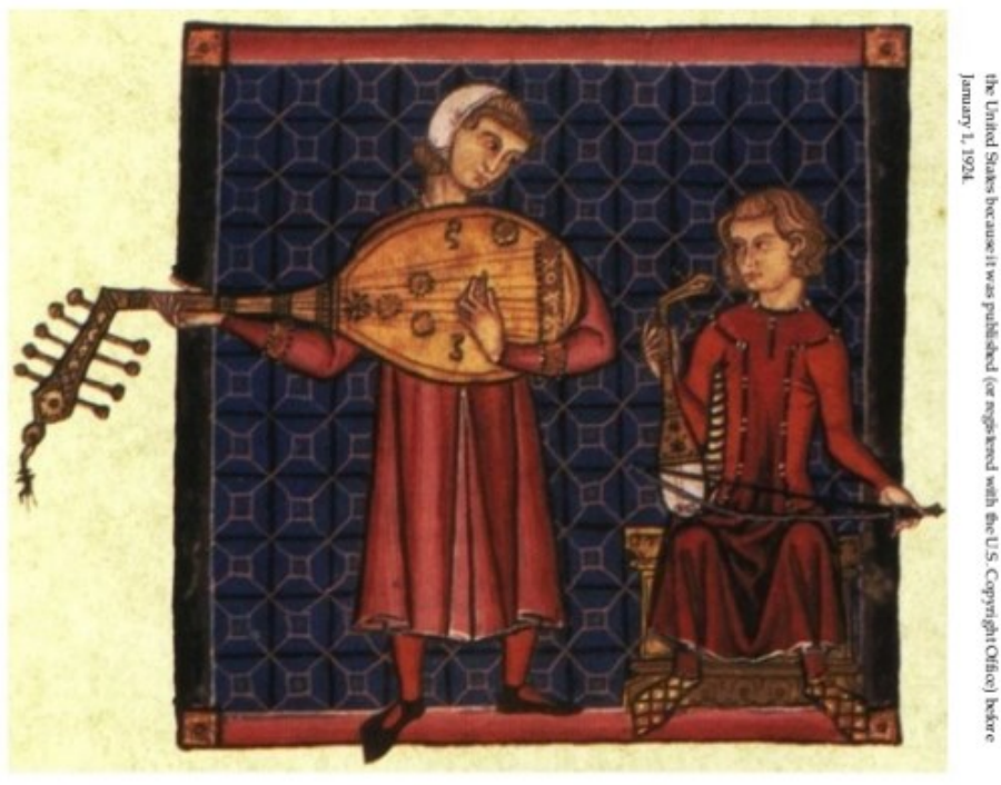
This work is in the public domain in its country of origin and other countries and areas where the cutyright term is the author's life plus 100 years or less. This work is in the public domain in the United Stakes because it was published (or registered with the U.S. Copyright Office) before January 1, 1994.