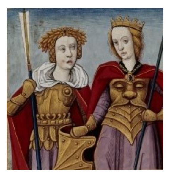
This work is in the public domain in its country of origin and other countries and areas where the copyright term is the author's life plus 70 years or fewer.