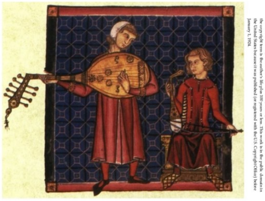
the cupyright ferm is the author's life-plus 100 years or less. This work is in the public domain in the United Stakes because it was published (or negistered with the U.S.Copyright Office) before January 1, 1924.