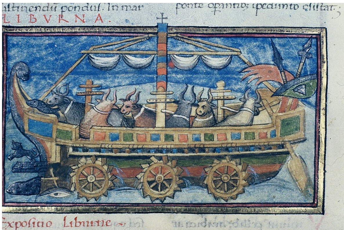
XVth Century Miniature of an ox-powered paddle wheel boat from the 4th century Roman military treatise De Rebus Bellicis by Anonymous This work is in the public domain in its country of origin and other countries and area where the copyright term is the author's life plus 100 years or less and in the United States because it was published (or registered with the US Copyright Office) before January 1, 1924