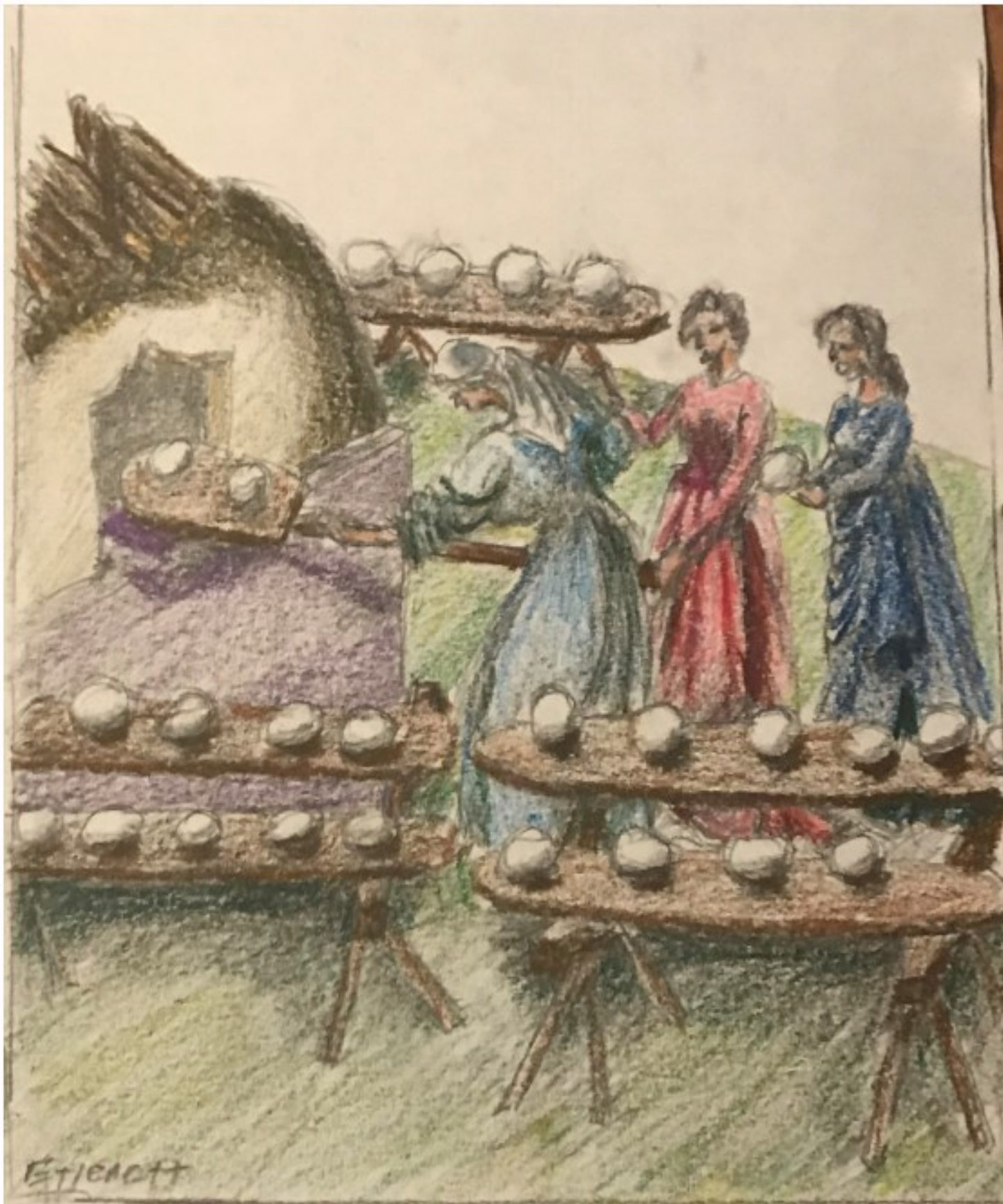
Reaping the benefits of the harvest.