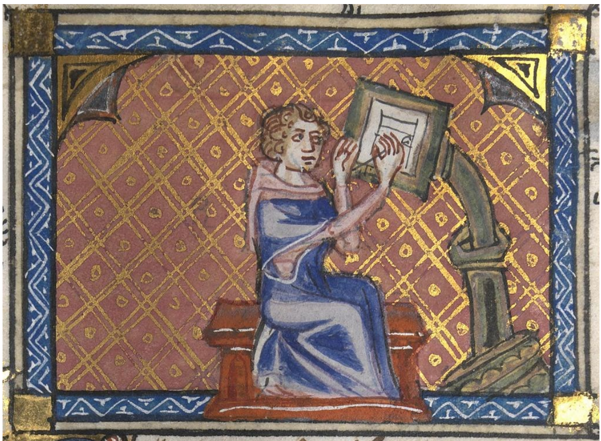
The Roman de la Rose manuscript. The author of a manuscript at his writing desk. 14th Century This file is made available under the Creative Commons CC0