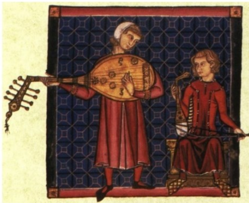
This work is in the public domain in its country of origin and other countries and areas where the copyright term is the author's life plus 100 years or less. This work is in the public domain in the United States because it was published (or registered with the U.S. Copyright Office) before January 1, 1924.