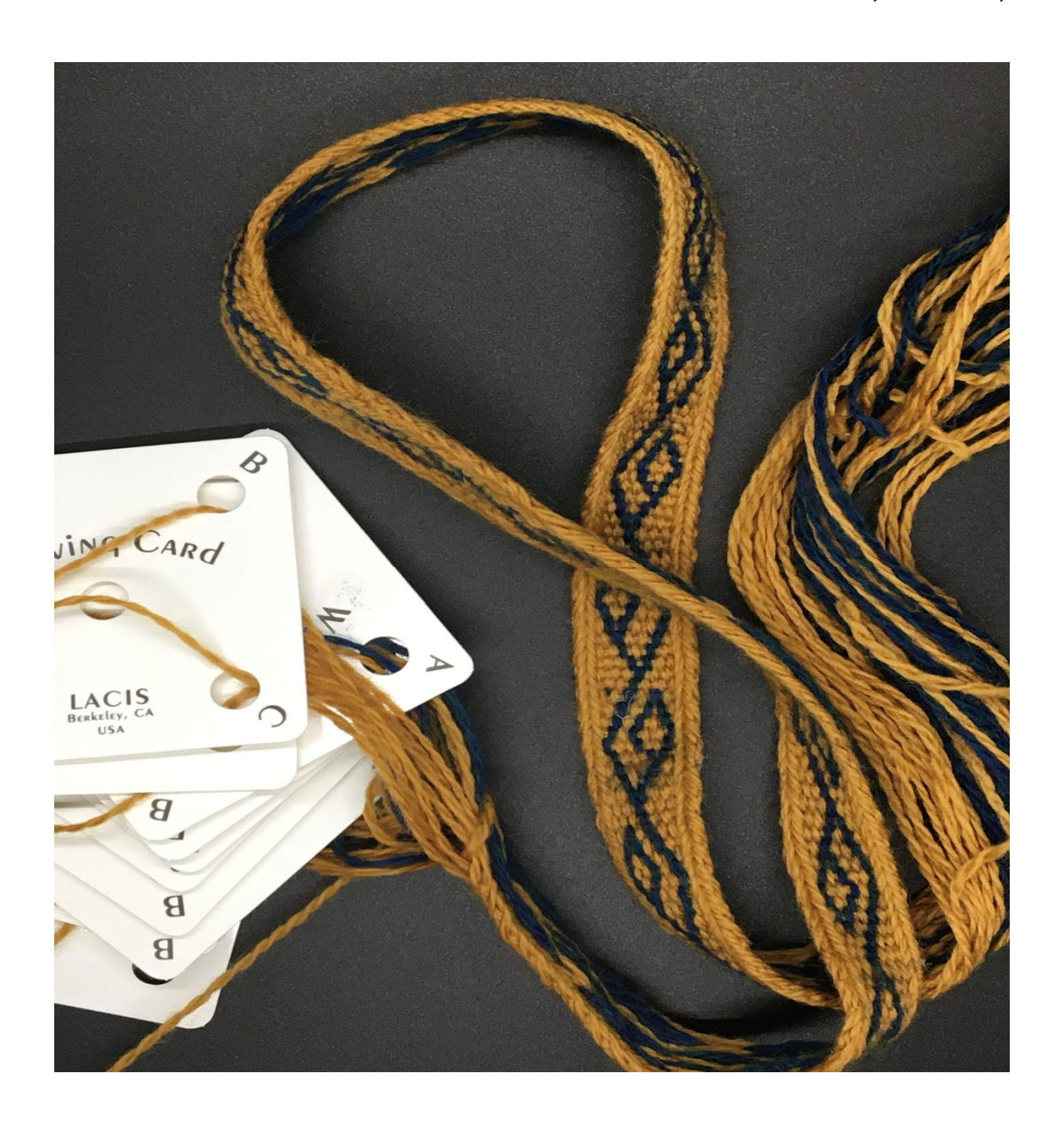
The Barony of Wiesenfeuer